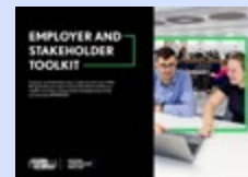
Employers and Stakeholders

Take a look at our tailored toolkits which explain how you can get involved in #NAW2025: