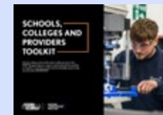
Schools, Colleges and Providers